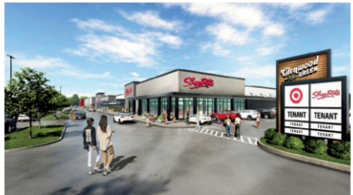
Glenwood Green – Old Bridge, NJ