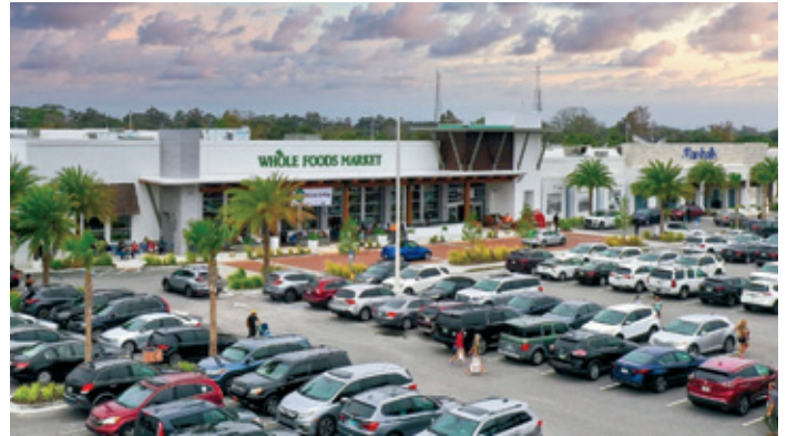
Pablo Plaza – Jacksonville Beach, FL