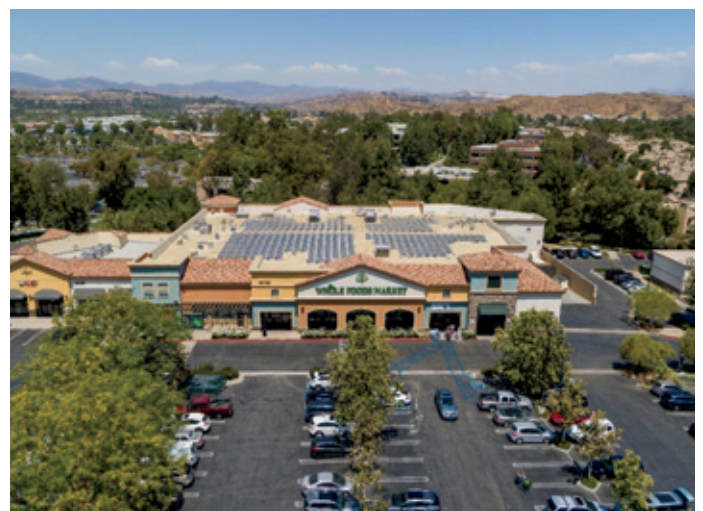
Valencia Crossroads – Valencia, CA