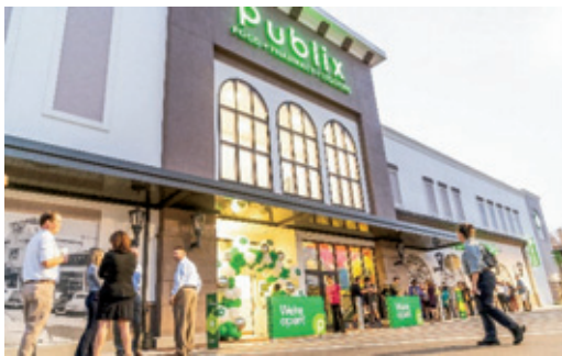
East San Marco – Jacksonville, FL

We enter 2023 with great momentum and persistent strength in the operating environment, and our leasing and value-creation pipelines are robust. We do recognize the uncertainty associated with the macroeconomic backdrop. While our centers and tenants may be largely recession-resistant, we would not be immune to a material slowdown in the U.S. economy. At the same time, we take comfort in having built a company and amassed a portfolio that can withstand as well as outperform through cycles. Our current tenant base is as strong and resilient as ever, and our exposure to struggling retailers is limited. The demographic profile of our trade areas, as well as the non-discretionary nature of our tenancy, insulates us from both inflationary and economic impacts on the consumer.