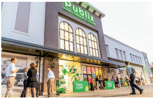
East San Marco – Jacksonville, FL

We enter 2023 with great momentum and persistent strength in the operating environment, and our leasing and value-creation pipelines are robust. We do recognize the uncertainty associated with the macroeconomic backdrop. While our centers and tenants may be largely recession-resistant, we would not be immune to a material slowdown in the U.S. economy. At the same time, we take comfort in having built a company and amassed a portfolio that can withstand as well as outperform through cycles. Our current tenant base is as strong and resilient as ever, and our exposure to struggling retailers is limited. The demographic profile of our trade areas, as well as the non-discretionary nature of our tenancy, insulates us from both inflationary and economic impacts on the consumer.