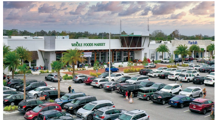
Pablo Plaza – Jacksonville Beach, FL